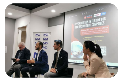
Investment Office co-hosted a session to present the prospects in tech sectors across Türkiye to a diversified community of Malaysian tech companies in collaboration

with Malaysia Digital Economy Corporation (MDEC), a government institution leading Malaysia's respective industries.